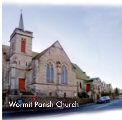
Wormit Parish Church